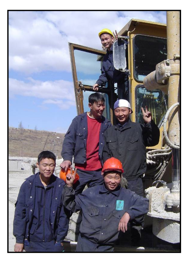
Students of the IGM Project's skills training courses learn bulldozer driving at Erdenet Technical College, 2005.

About half of all children working in artisanal mining are in their late teens, aged around 15-17. For these children returning to school is often not an option. They have long ago given up ambitions of study and feel awkward going to school with younger students. What is important for them is to work and earn money. All projects included skills training. MVA and WCUB focused on skills training that could be provided in the local area through the labour offices, while the IGM project drew on the training provided by Erdenet Technical College Mongolian-Korean the College and Ulaanbaatar. MONEF's approach stands out as the project invested substantially in order to build the skills training programme up to a professional level. Contracts were signed with each college and boarding was arranged for students. The generic modules, which were developed by MONEF in collaboration with colleges and other project partner organizations, were very useful in preparing students for studies or for employment. A greater number of adolescents was trained through the IGM project than through the other