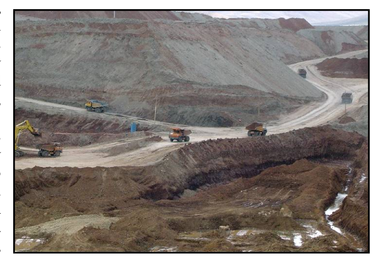
Large-scale placer gold-mining operation in Zaamar Soum

generated a new, but still small, industry of mining support services in rural areas. The mining sector is bound to be a priority in a country little arable land. manufacturing and commerce sectors, and a low technology and skills base. Mongolia, with about 36 percent of its population living under the poverty line, is a country struggling to embrace free market economics and to survive economic competition from its powerful neighbours, China and Russia. 5 In its informal aspects, mining has become a survival strategy for ex-herders, the unemployed and children trying to find an income.