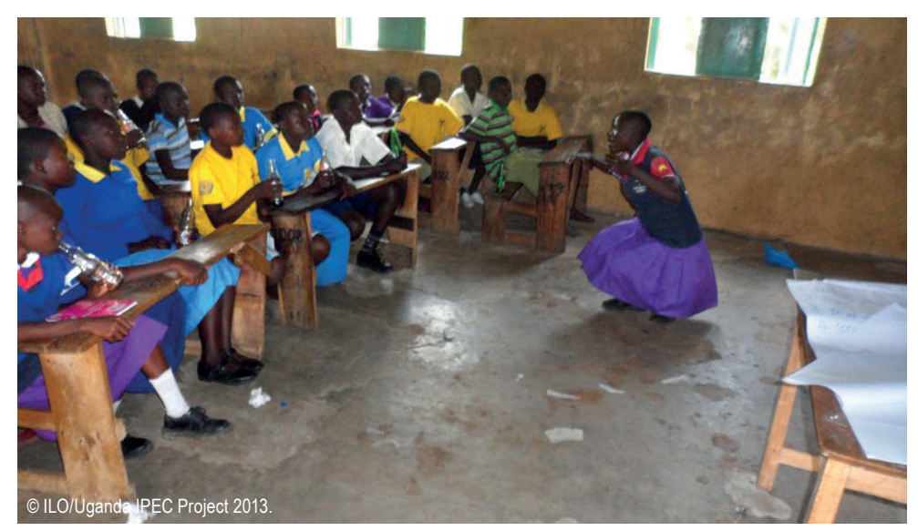
Awareness-raising activities against child labour, 2013.

Using the SCREAM programme, teachers were trained on child labour and how best to respond to children needs in school. Furthemore, children were empowered and given opportunities to engage in creative activities in which they expressed themselves the best way they understood child labour. They developed information, education and communication (IEC) materials, poems, songs, drama skits, and talked to their friends on the dangers of child labour. In some areas within the project sites children were represented in Local Child Labour Committees and were guests of honour in all events they were involved in. The level of involvement of children, methods used and the space accorded to them to express themselves and create awareness on child labour in this project was unprecedented. The photos show a school girl performing a poem to her peers, and messages on child labour and other awareness-raising materials created by children through SCREAM programme.