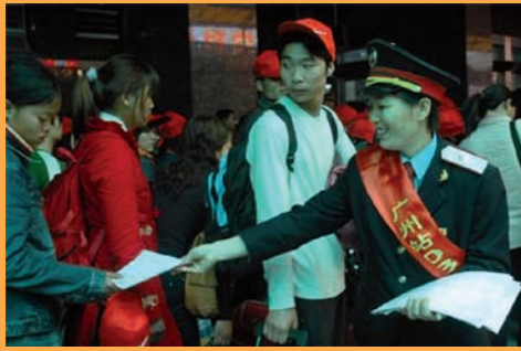
Railways staff help to raise awareness against trafficking and promote safe migration during the Chinese New Year (Photo: ILO, February 2007).