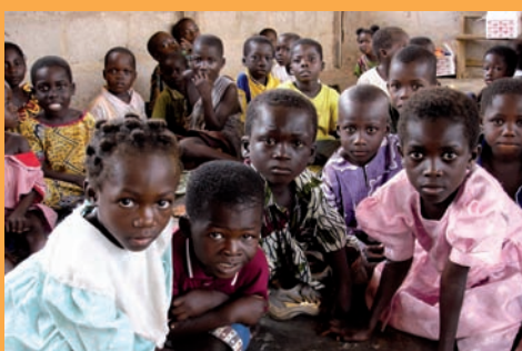
Children at risk of trafficking in Fishermen communities in Ga District (GHANA) back in school. (Photo: ILO/J.Heitz, November 2005).