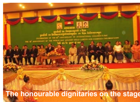
The honourable dignitaries on the stage

ILO IPEC, UNICEF, with the Cambodian National Council for Children (CNCC), the Ministry of Social Affairs Veteran and Youth