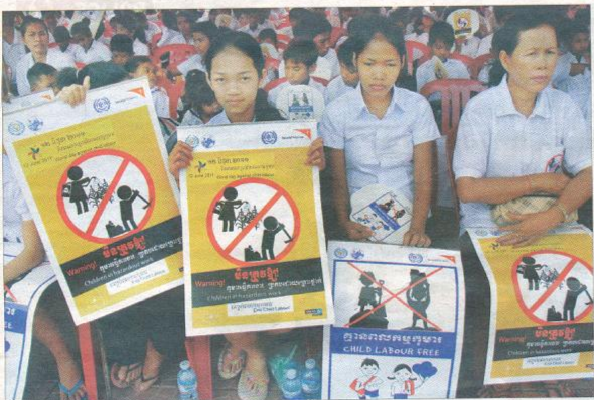
Children hold anti-child labour posters during a gathering at Wat Botum park in Phnom Penh yesterday. PHA LINX