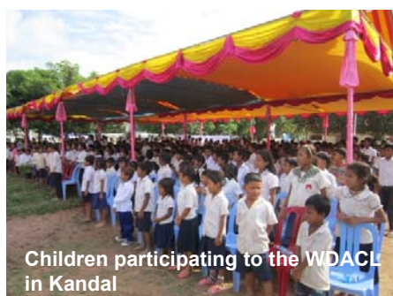
Children participating to the WDACL in Kandal

Awareness raising materials including Street Banners, T-Shirts, Balloons, Leaflets, Posters, Brochure, Press and media etc. on child labour on the theme Warning! Children in Hazardous work – End Child Labour! were developed, produced, and widely distributed and disseminated drawing great attention of the public, employers, workers, NGOs, civil society, etc on child labour in the province. The promotional materials produced were funded by ILO IPEC and KHANA.