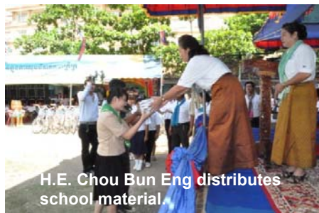
H.E. Chou Bun Eng distributes school material.

including representatives from the DOCL/MLVT, Provincial Governance, Provincial Council, Provincial Department of Labour and Vocational Training of Banteay Meanchey, other Provincial Departments, representatives from Poipet Municipality Governance, NGOs and Civil Society Groups, teachers, parents, school children and representatives of targeted children in Poipet, Banteay Meanchey participated in the event.