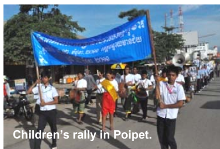
Children's rally in Poipet.

The WDACL was observed on 10 June 2011 in Banteay Meanchay Province, within the compound of Palelei Pagoda in Poipet, starting with a Children's rally against child labour that started from the Poipet Circle and wound its way to Palelei Pagoda where a public gathering was held. The focus of the rally and the event was on theme " Warning! Children in Hazardous Work – End Child Labour ". Around 600 participants