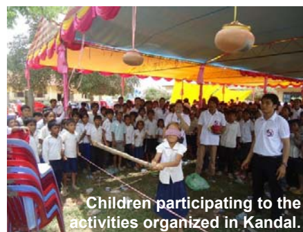
Children participating to the activities organized in Kandal.