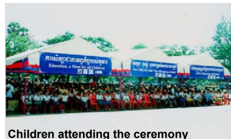
Children attending the ceremony

On 11 June 11, the Angkor Wat Children's Mini Marathon against Child Labour was held in Siem Reap. Around 250 competitors of whom 200 were children and over 50 were adults took part in the marathon to highlight their stand against child labour. The competitors wore t-shirts printed with the theme of the WDACL 2011 " Warning! Children in Hazardous Work – End Child Labour ". They ran from the outskirt of Siem Reap through the main streets of the town where many businesses are located and amongst crowds of tourists and public who had gathered to see them at the finishing post which was in the area in front of the historic Angkor Wat temple, where later the Prize Giving Ceremony was also held.