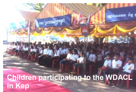
Children participating to the WDACL in Kep

On 08 June 2011 the observance of the World Day Against Child Labour was held at the Wat Chakrya Vong Pagoda, Okrasar Village, Okrasar Commune, Damnak Chang Oeur District in Kep Province. Around 725 participants of whom 270 were the Direct Beneficiary children of the ILO IPEC Project, 90 parents', 38 representatives of local authorities, 11 teachers, 22 members of the Provincial Committee on Child Labour, 10 representatives of employers and trade union, 5 NGOS, 10 civil society groups, etc. participated in the event, wearing t-shirts printed with this year's theme of the WDACL.