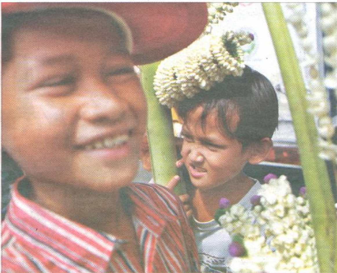
Two Cambodian boys sell garlands at Kandal Market in downtown Phnom Penh yesterday.

I have been working on child labour in Cambodia for six years now and I can realistically say that if the present pace of work continues, Cambodia can end the worst forms of child labour by 2016. Already we are seeing remarkable declining trends of child labour. In Kep province in 2008, a study found 2000 children working in the worst forms of child labour. In